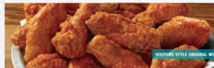
HOOTERS STYLE ORIGINAL WINGS