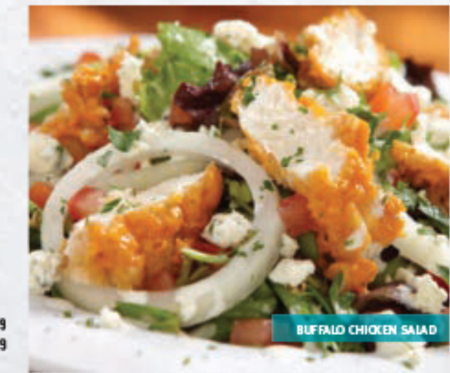
BUFFALO CHICKEN SALAD

CHICKEN GARDEN SALAD Spring mix greens piled with diced tomatoes, crisp cucumbers, cheddar cheese, Monterey Jack cheese and croutons and your choice of salad dressing. Topped with grilled or fried chicken. 10.29 Salad only, hold the chicken 7.29 Upgrade to blackened Mahi-Mahi instead of fried chicken 4.29