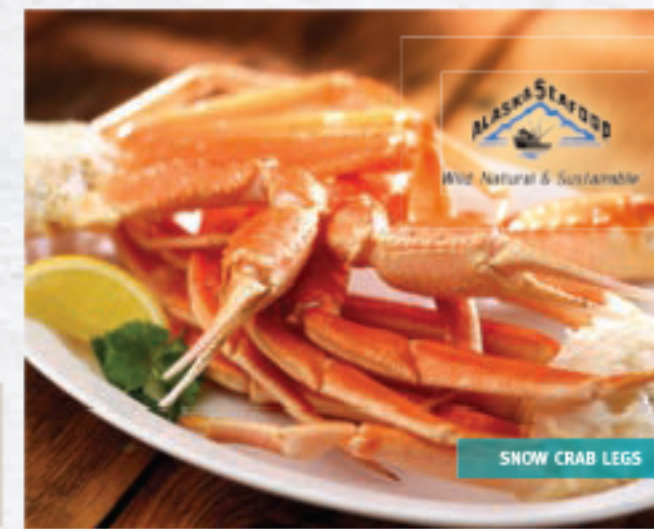
ALASKA SEAFOOD Wild, Natural & Sustainable

CLAM CHOWDER 4.29 New England style clam chowder.