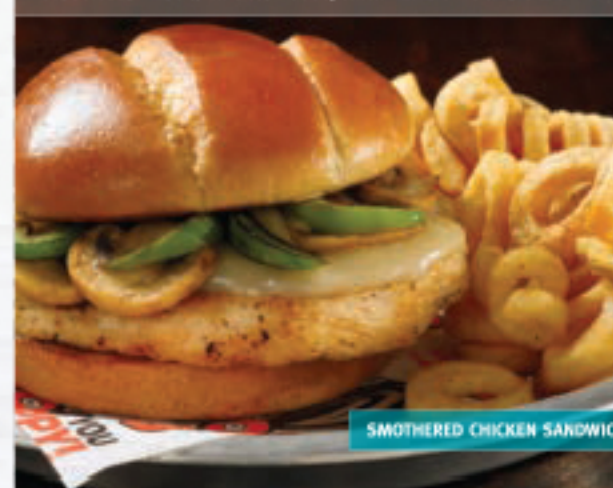
SMOTHERED CHICKEN SANDWICH

ALL SANDWICHES ARE SERVED WITH A SIDE OF CURLY FRIES OR COLESLAW. SUBSTITUTE FRIES WITH TATER TOTS, ONION RINGS OR A SIDE SALAD +.99